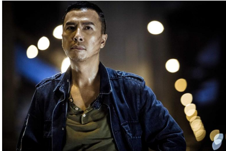
Donnie Yen as Hahou Mo in KUNG FU JUNGLE