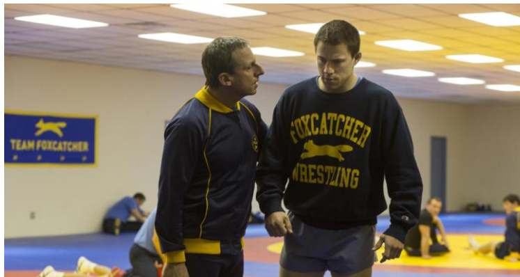
Steve Carell (John du Pont) and Channing Tatum (Mark Schultz) in FOXCATCHER

Embargoed until 12.00pm midday UK, Friday 29 August, 2014