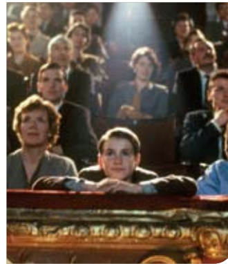
The Long Day Closes (1992)

As the costs spiral of operating a 1950s building that was shoe-horned under a major road bridge, the Southbank spaces look increasingly marginalised while large sums of public money are poured into other national cultural facilities. And the BFI National Library, operating from extremely constrained spaces at Stephen Street, is unable to provide the facilities or environment expected of a modern research library. Despite the high quality of the BFI's knowledge creation work, the split between these London facilities only adds to our problems in providing a coherent, integrated public offer.