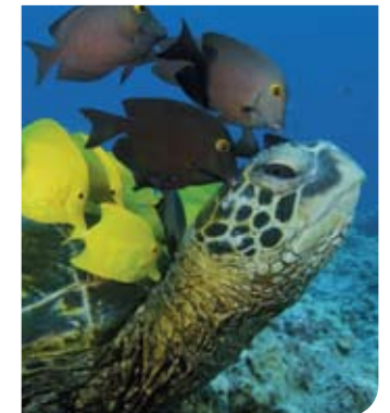
Deep Sea 3D (2006)