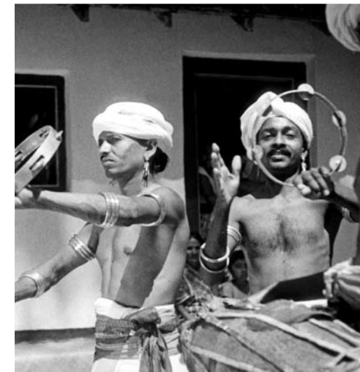
Song of Ceylon