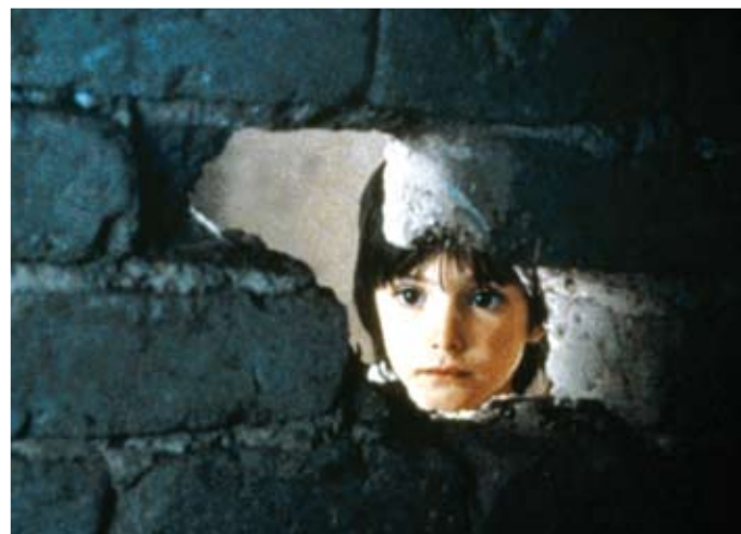
The Spirit of the Beehive (1973)

Almost half of the local authorities in England took part in the BFI's Reframing Literacy campaign, using film in the classroom to improve reading and writing skills.