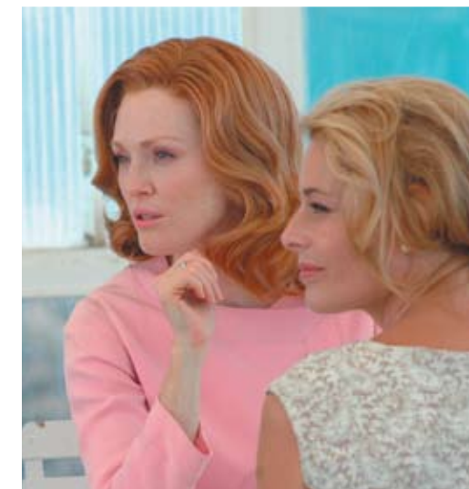
Savage Grace (2007)