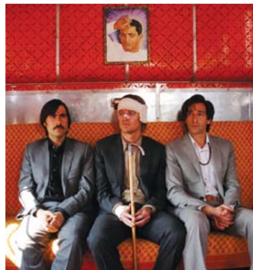
The Darjeeling Limited (2007)