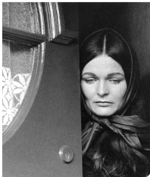
Bleak Moments (1971)

A representative selection of the output of the UK's commercial television channels was recorded: in 2007-08 this included 20.43% of ITV output, 18.68% of Channel Four; and 11.9% of Channel Five.