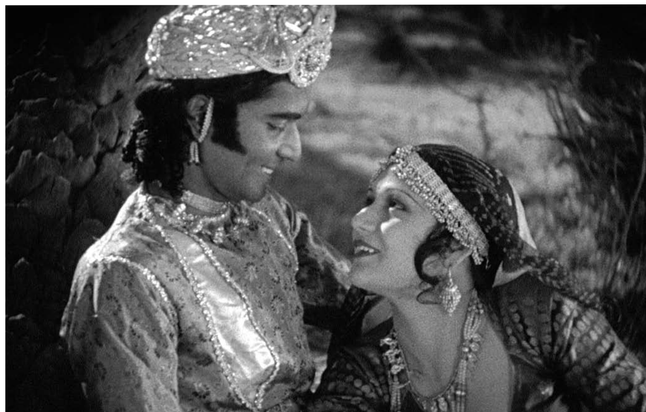
A Throw of Dice (1929)

A staggering two hundred films were either restored, screened, made available for DVD or put on theatrical tour as part of the BFI's Documentary Centenary, a programme which demonstrated the extraordinary influence of the British documentary movement.