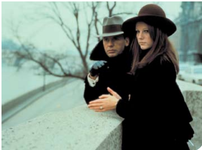
The Conformist (1970)

The BFI holds in trust for the nation the world's most important archive of the moving image. It is one of the world's most significant cultural treasures. Around 850,000 titles – from the birth of cinema through the introduction of television, from every corner of the world – are preserved, stored and made accessible. The BFI National Archive also includes the world's largest specialist collection of books and periodicals related to film and television, accessible to scholars through the BFI National Library. We are developing a new partnership with a consortium of UK higher education institutions to make this material even more accessible.