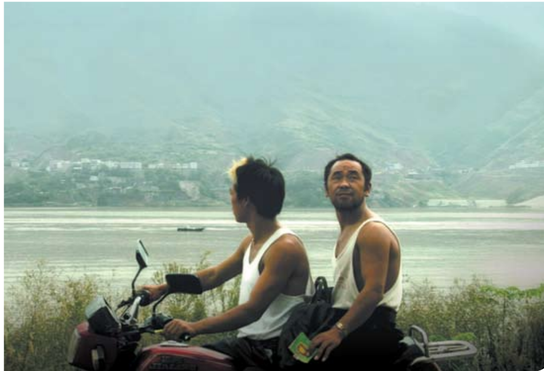
Still Life (2006)

In recent years, as a result of the digital revolution, the BFI has found new ways of enabling the British public to access this unique archive. We have extended our distribution activities well beyond theatrical distribution to a whole host of digital initiatives, broadcast partnerships and BFI Mediathèques. Here, drop-in visitors can rifle through hundreds of hours of digitised archive material, viewing film that cannot be made available on-line because of rights restrictions. Following London, the aim is to create a network of Mediathèques across the whole of the UK.