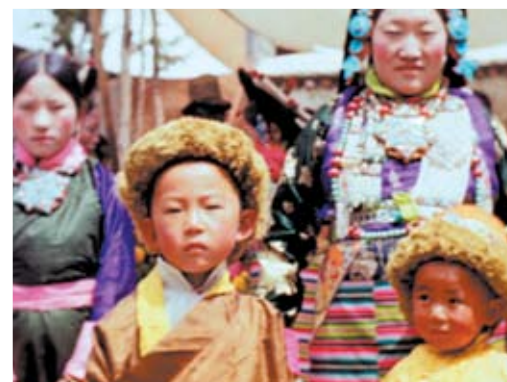
The Lost World of Tibet (BBC4 2007)

These very solid audience figures show, once again, how much public demand there is for archive material, and how it can be used to enable us to discover new facts about our world and where we have come from. They follow the staggering success of our BBC co-production The Lost World of Mitchell & Kenyon , which is still the highest-rated archival film programme ever broadcast.