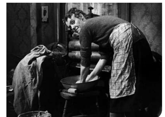
Land of Promise (1946)