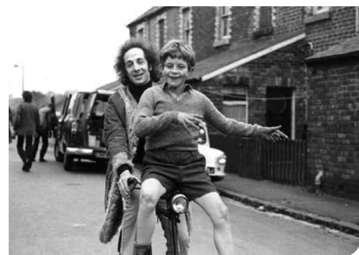
My Ain Folk (1973)