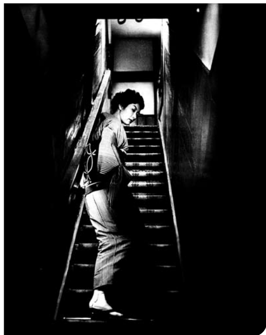
A Woman Ascends the Stairs (1960)

The BFI acts as a central resource from which material can be produced that impacts across all the UK. For example, 2007/ 2008 saw the culmination of a major three-year campaign led by the BFI to get film into schools. The literacy curriculum which all children have to follow was our focus, and we argued that film is a fundamental part of literacy in the 21st century. Our long-term goal is for all children under 14 in the UK to be able study film as an entitlement throughout their school career.