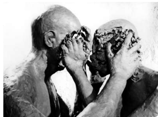
Moznosti Dialogu (1982)

Our DVD publishing operation works in close partnership with the other parts of the BFI. Having launched a major season of the works of the British Documentary Movement at BFI Southbank, we toured a selection of these films to all the nations and regions of the UK as well as internationally. And towards the end of 2007-08 we launched a major four-disc DVD featuring the most important films from this movement: Land of Promise was received to rave reviews. In the first three months since release it has sold more than 3,000 units, a superb performance for a premium-priced package.