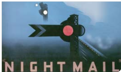
Night Mail (1936)

As part of its advocacy work in Education, the BFI has run a series of residential training sessions across England and has so far reached 61 local authorities (parallel work has been going on in Northern Ireland, Wales, and Scotland). Seven DVDs, featuring 55 short films from all over the world, have been produced and by January 2008 some 12,000 copies had been sold to 6,000 schools; this represents about one school in twenty, so there is still plenty of scope for this programme to grow.