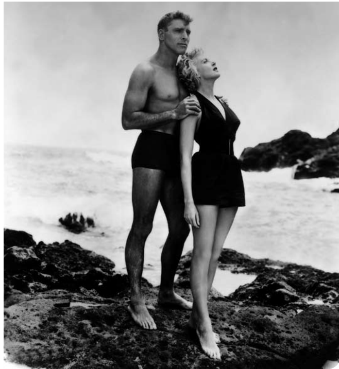
From Here to Eternity (1953)

And our London public venues – split between BFI Southbank, BFI IMAX and the BFI at Stephen Street – are not ideal. Southbank has recently benefited from some capital investment to refurbish and develop its facilities, which has resulted in a very substantial increase in audiences and the opportunity to offer free public access to a part of the archive through the new Mediatheque. But the Southbank cinemas themselves – state-of-the-art in the 1950s – are nowhere near the standard that should be expected of Britain's national cinemas.